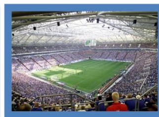
Allianz Arena Home of Bayern Munich

*The above itinerary is a provisional/suggested itinerary and can/will change depending on your group's specific wishes, the final game schedule for your team(s) and any pro game visit(s) incorporated for your group. Sightseeing admission fees are not included in the prices but can be added and pre-booked based on your group's specific wishes. Consult us for more information.