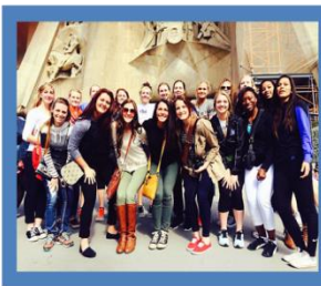
University of Mary