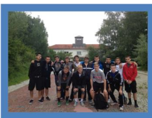
Putnam City North High School