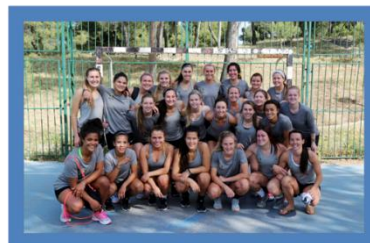
University of Colorado