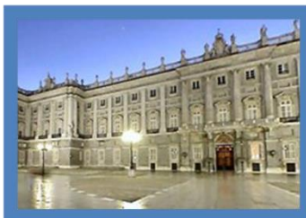
Madrid Royal Palace