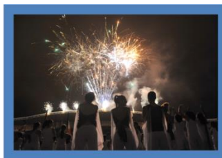
Donosti Cup Opening Ceremony

*The above itinerary is a provisional/suggested itinerary and can/will change depending on your group's specific wishes, the final game schedule for your team(s) and any pro game visit(s) incorporated for your group. Sightseeing admission fees are not included in the prices but can be added and pre-booked based on your group's specific wishes. Consult us for more information.