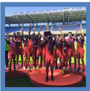
Dallas Texans Soccer Club