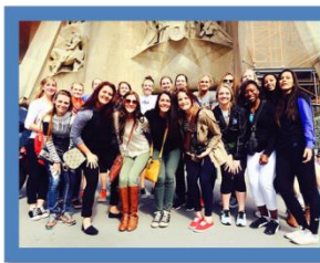
University of Mary