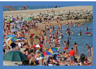
Lloret de Mar Beach