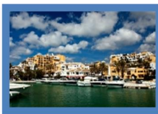
City of Marbella