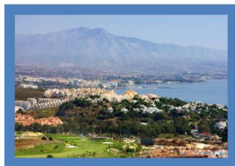
Marbella City Skyline