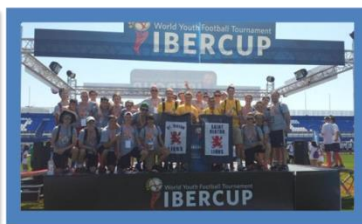
Saint Viator Lions