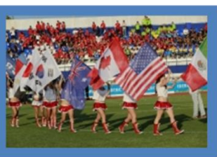
IberCup Costa del Sol