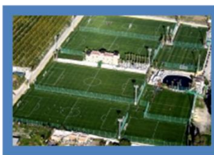
IberCup Costa del Sol