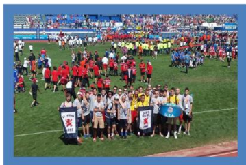
Saint Viator Lions