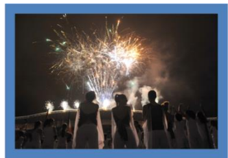
Donosti Cup Opening Ceremony