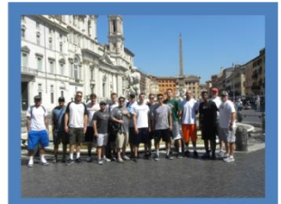
SCIAC All Stars

*The above itinerary is a provisional/suggested itinerary and can/will change depending on your group's specific wishes, the final game schedule for your team(s) and any pro game visit(s) incorporated for your group. Sightseeing admission fees are not included in the prices but can be added and pre-booked based on your group's specific wishes. Consult us for more information.