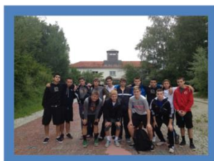
Putnam City North High School