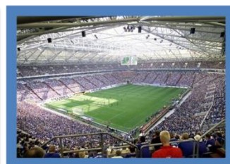
Allianz Arena Home of Bayern Munich

*The above itinerary is a provisional/suggested itinerary and can/will change depending on your group's specific wishes, the final game schedule for your team(s) and any pro game visit(s) incorporated for your group. Sightseeing admission fees are not included in the prices but can be added and pre-booked based on your group's specific wishes. Consult us for more information.