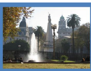
Plaza de Mayo