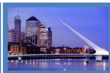
Buenos Aires Bridge