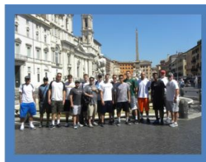
SCIAC All Stars