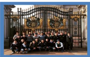
Wisconsin Lutheran College