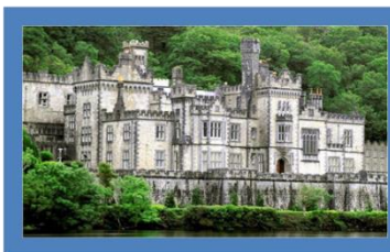
Galway Kylemore Abbey