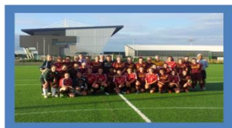
Ohio Wesleyan Soccer