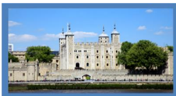
Tower of London