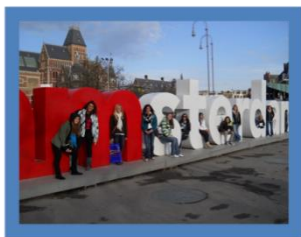
Northern State University