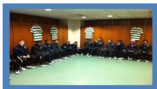
US Club Soccer id2 Program