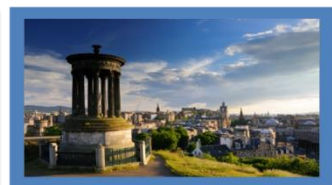
City of Edinburgh