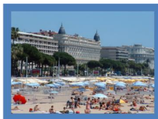
Beach in Cannes