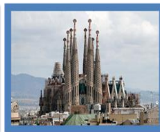
La Sagrada Família