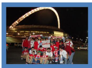
Glenn Falls High School