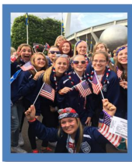
Norco Soccer Club