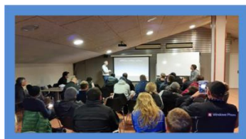
Coaches Education Sessions

Premier International Tours is offering an additional free trip for the team coach or another representative from your group to Barcelona, Spain on January 30 th – February 3 rd of 2020 if you book your 2020 team tour by October 1, 2019 . This 5-day trip will include a visit to an FC Barcelona game, the Nou Camp and FC Barcelona's training facilities, a session with youth coaches from RCD Espanyol and some great sightseeing in Barcelona!