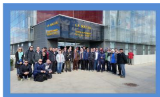
FC Barcelona Training Facility