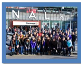
Arsenal Game Albion College

HAMPTON COURT PALACE: Hampton Court Palace is a royal palace in the London Borough of Richmond upon Thames, Greater London, in the historic county of Middlesex; it has not been inhabited by the British Royal Family since the 18th century.