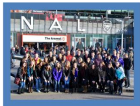
Arsenal Game Albion College