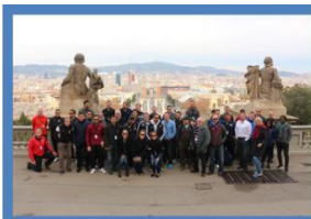
Barcelona - Spain