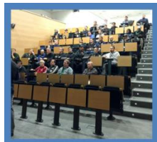
Coaches Education Session

Click here for a trip report and pictures from our 2019 Barcelona Coaches Tour.