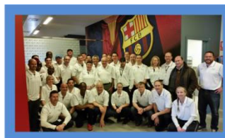
Barcelona Coaches Tour