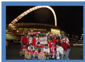
Glenn Falls High School