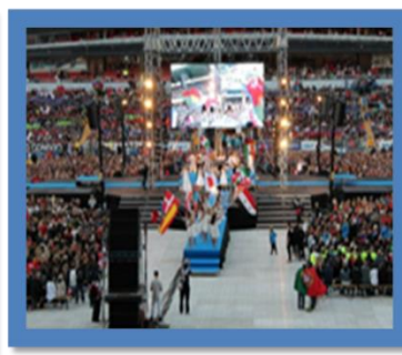
Gothia Cup Opening Ceremony

For more information about the tournament including age groups, rules and regulations and touristic/sightseeing information please visit the tournament website: www.gothiacup.se .