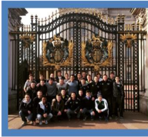
Wisconsin Lutheran College