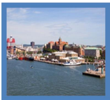
City of Gothenburg