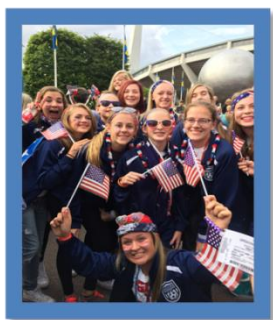
Norco Soccer Club