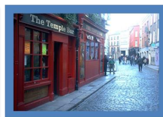
Streets of Dublin

*The above itinerary is a provisional/suggested itinerary and can/will change depending on your group's specific wishes, the final game schedule for your team(s) and any pro game visit(s) incorporated for your group. Sightseeing admission fees are not included in the prices but can be added and pre-booked based on your group's specific wishes. Consult us for more information.