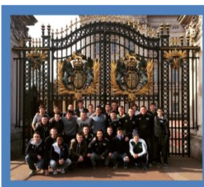
Wisconsin Lutheran College