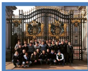
Wisconsin Lutheran College