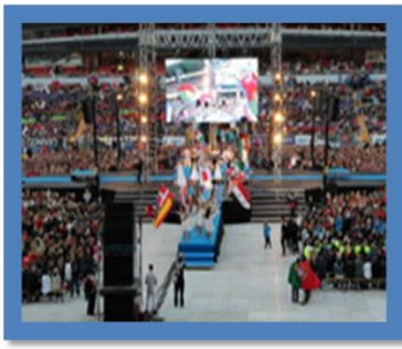
Gothia Cup Opening Ceremony

For more information about the tournament including age groups, rules and regulations and touristic/sightseeing information please visit the tournament website: www.gothiacup.se .