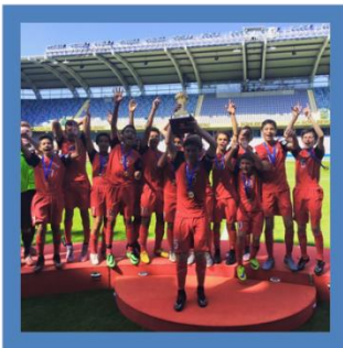
Dallas Texans Soccer Club