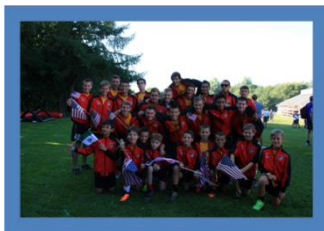
Dallas Texans Boys