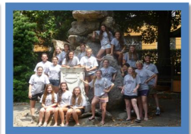
Lake Hill Storm SC

*The above itinerary is a provisional/suggested itinerary and can/will change depending on your group's specific wishes, the final game schedule for your team(s) and any pro game visit(s) incorporated for your group. Sightseeing admission fees are not included in the prices but can be added and pre-booked based on your group's specific wishes. Consult us for more information.