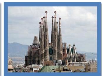
La Sagrada Familia