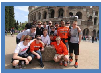
Wartburg College Men's Soccer