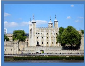
Tower of London