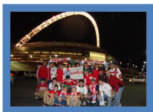
Glenn Falls High School