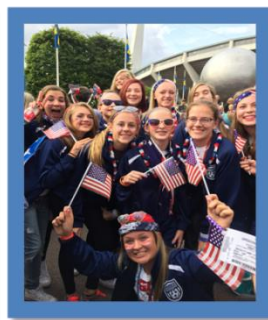
Norco Soccer Club