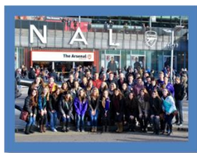
Arsenal Game Albion College

HAMPTON COURT PALACE: Hampton Court Palace is a royal palace in the London Borough of Richmond upon Thames, Greater London, in the historic county of Middlesex; it has not been inhabited by the British Royal Family since the 18th century.