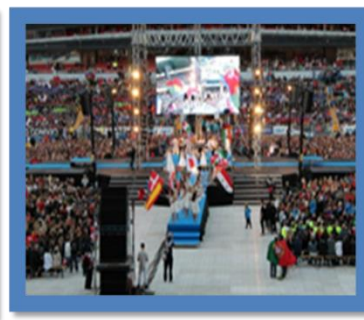
Gothia Cup Opening Ceremony

For more information about the tournament including age groups, rules and regulations and touristic/sightseeing information please visit the tournament website: www.gothiacup.se .