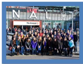
Arsenal Game Albion College