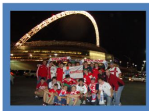
Glenn Falls High School