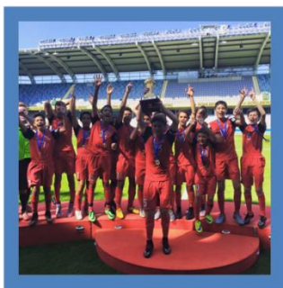
Dallas Texans Soccer Club