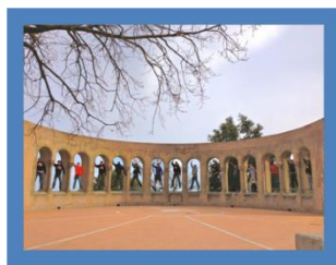
Cal Tech University