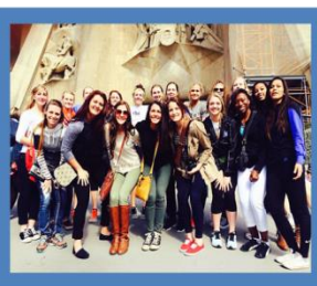
University of Mary