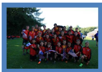
Dallas Texans Boys