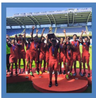
Dallas Texans Soccer Club