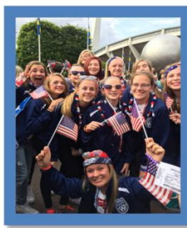
Norco Soccer Club