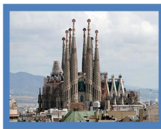
La Sagrada Familia