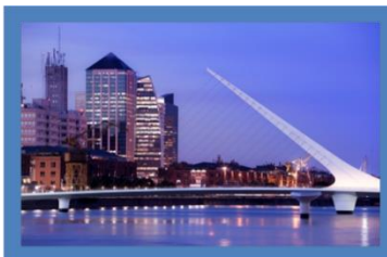
Buenos Aires Bridge