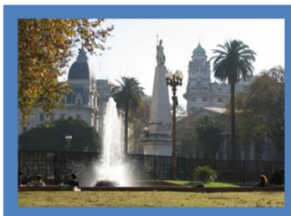
Plaza de Mayo