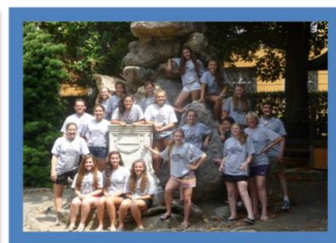
Lake Hill Storm SC

*The above itinerary is a provisional/suggested itinerary and can/will change depending on your group's specific wishes, the final game schedule for your team(s) and any pro game visit(s) incorporated for your group. Sightseeing admission fees are not included in the prices but can be added and pre-booked based on your group's specific wishes. Consult us for more information.