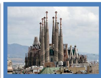
La Sagrada Familia