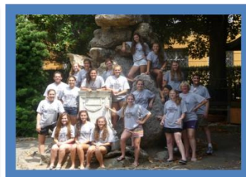
Lake Hill Storm SC