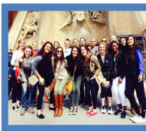
University of Mary