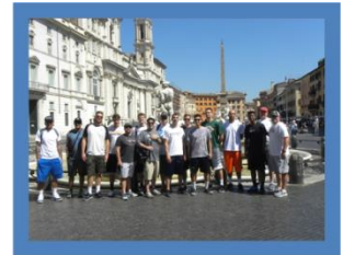
SCIAC All Stars

The Roman Forum: The Roman Forum is a rectangular forum (plaza) surrounded by the ruins of several important ancient government buildings at the center of the city of Rome. Citizens of the ancient city referred to this space, originally a marketplace, as the Forum Magnum, or simply the Forum. Located in the small valley between the Palatine and Capitoline Hills, the Forum today is a sprawling ruin of architectural fragments and intermittent archaeological excavations attracting 4.5 million sightseers each year.