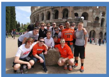
Wartburg College Men's Soccer