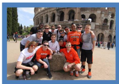
Wartburg College Men's Soccer