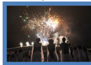
Donosti Cup Opening Ceremony