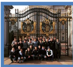
Wisconsin Lutheran College