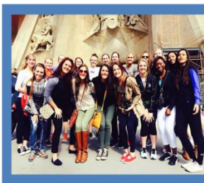
University of Mary