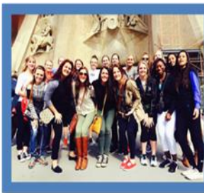
University of Mary