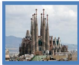
La Sagrada Familia