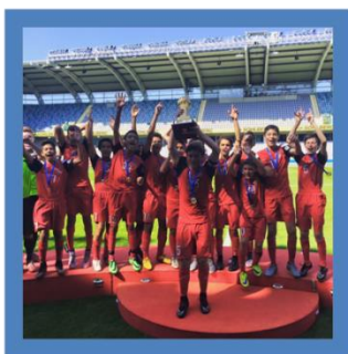
Dallas Texans Soccer Club