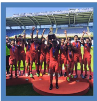
Dallas Texans Soccer Club