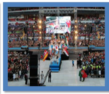
Gothia Cup Opening Ceremony

For more information about the tournament including age groups, rules and regulations and touristic/sightseeing information please visit the tournament website: www.gothiacup.se .