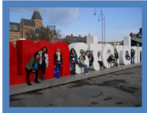
Northern State University