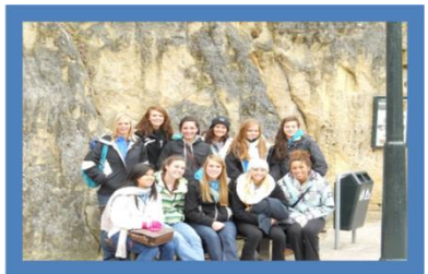
Northern State University

*The above itinerary is a provisional/suggested itinerary and can/will change depending on your group's specific wishes, the final game schedule for your team(s) and any pro game visit(s) incorporated for your group. Sightseeing admission fees are not included in the prices but can be added and pre-booked based on your group's specific wishes. Consult us for more information.