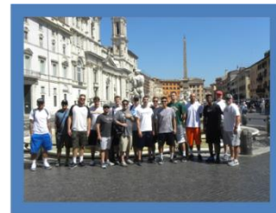
SCIAC All Stars

*The above itinerary is a provisional/suggested itinerary and can/will change depending on your group's specific wishes, the final game schedule for your team(s) and any pro game visit(s) incorporated for your group. Sightseeing admission fees are not included in the prices but can be added and pre-booked based on your group's specific wishes. Consult us for more information.