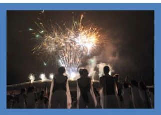
Donosti Cup Opening Ceremony