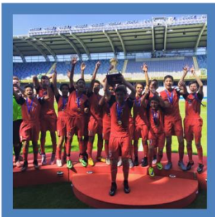
Dallas Texans Soccer Club