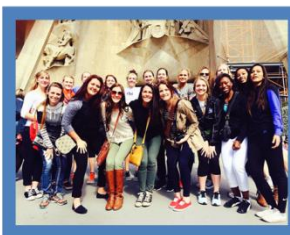
University of Mary