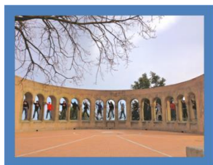
Cal Tech University