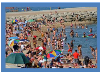
Lloret de Mar Beach