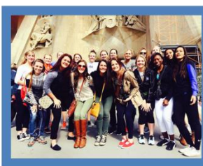
University of Mary