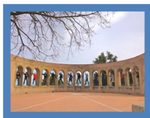
Cal Tech University