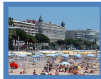
Beach in Cannes