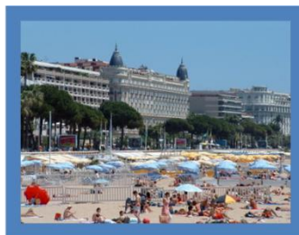
Beach in Cannes