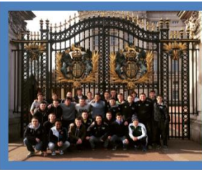
Wisconsin Lutheran College