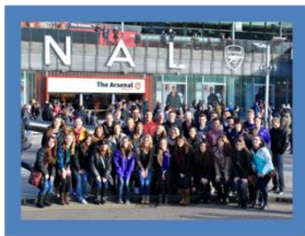
Arsenal Game Albion College

HAMPTON COURT PALACE: Hampton Court Palace is a royal palace in the London Borough of Richmond upon Thames, Greater London, in the historic county of Middlesex; it has not been inhabited by the British Royal Family since the 18th century.