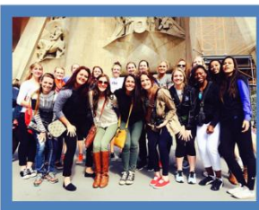
University of Mary