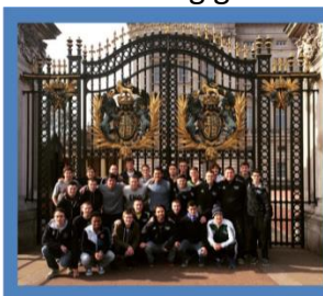
Wisconsin Lutheran College