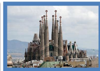
La Sagrada Familia