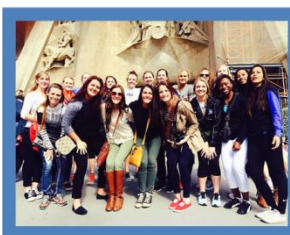
University of Mary