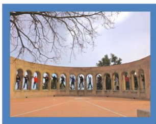
Cal Tech University