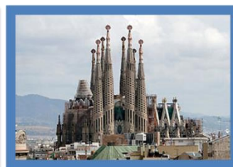
La Sagrada Familia