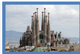
La Sagrada Familia