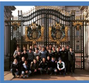
Wisconsin Lutheran College