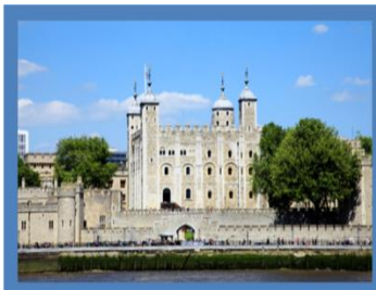
Tower of London