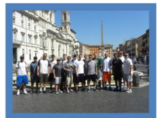
SCIAC All Stars

*The above itinerary is a provisional/suggested itinerary and can/will change depending on your group's specific wishes, the final game schedule for your team(s) and any pro game visit(s) incorporated for your group. Sightseeing admission fees are not included in the prices but can be added and pre-booked based on your group's specific wishes. Consult us for more information.